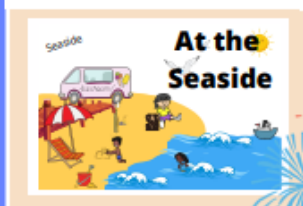
At the Seaside

In this unit children will develop their expressive movement through the topic of 'places'. Children explore space and how to use space safely. They explore traveling actions, shapes and balances. Children choose their own actions in response to a stimulus. They also are given the opportunity to copy, repeat and remember actions. They continue to use counting to help them keep in time with the music. They explore dance through the world around them. They perform to others and begin to provide simple feedback.