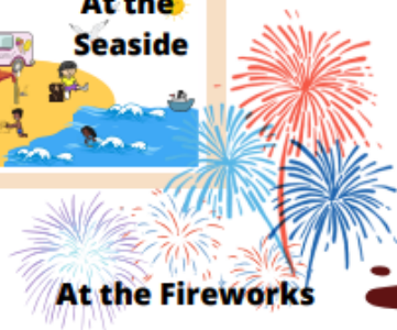
At the Fireworks