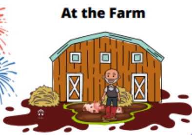
At the Farm