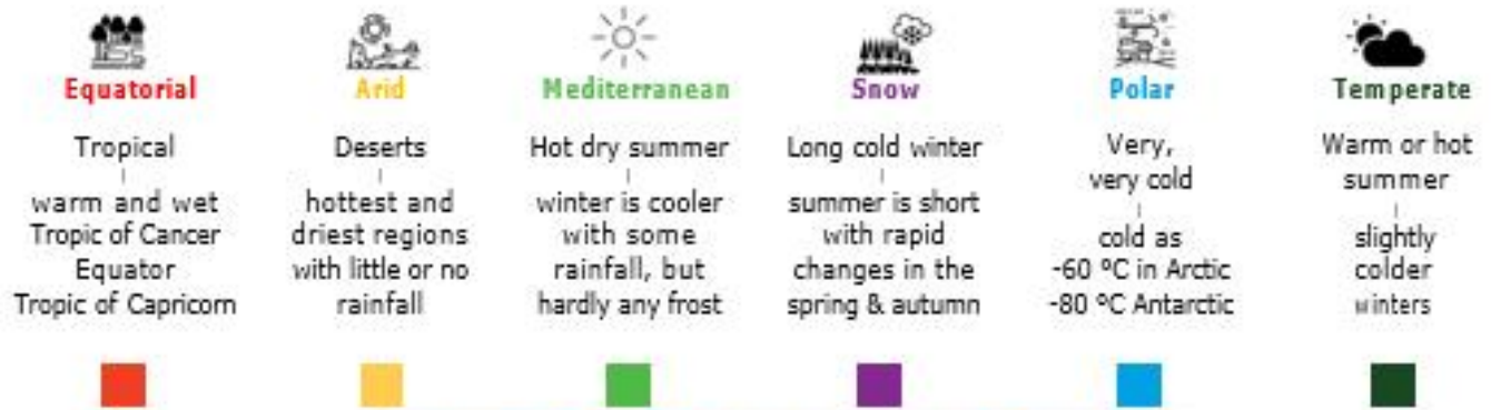
Environment region map of the world